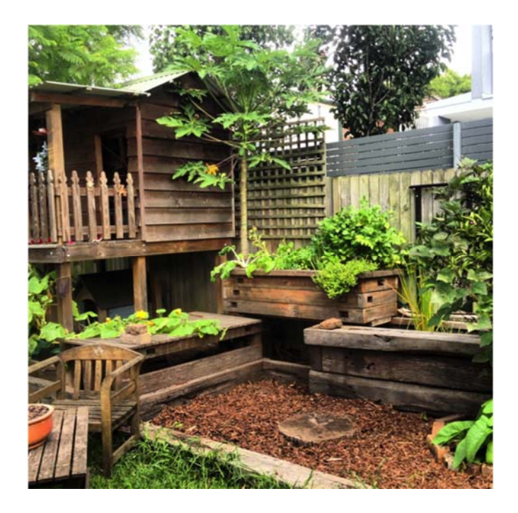
Figure 2. Photo of wooden backyard aquaponics system.

Aesthetics of the systems was a stronger concern than originally expected (n = 11, FG = 3). The artificial or constructed appearance of the aquaponics systems discouraged some people. Some participants asked if the systems could be naturalized, and commented that they would happily have a 'pretty' system such as the example photo of one encased in timber (Figure 2), but not one with lots of pipes showing. Having the system fit into the look of their backyard came across as a strong factor in participants' willingness to add aquaponics to their existing garden.