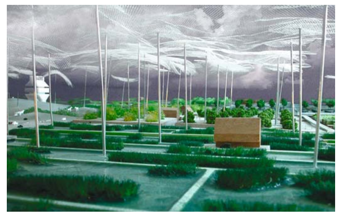
Figure 3. The Rice Department, Photo by Kolpa Architects [8]