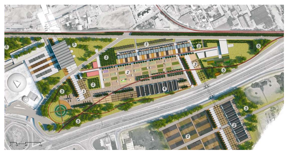
Figure 9. Masterplan, Cells [18]

It is a deliberate proposal for local-grown food and using the forces of the site, like solarenergy and rainwater, but is step by the conceptual formulation. There is no use of potentials from "Red and Green".