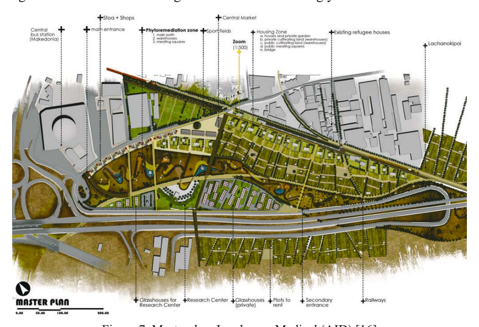
Figure 7. Masterplan, Landscape Medical (AID) [16]

Moreover the personality needs private efforts to be proud of, hence this kind of common work doesn't generate the growth of communities[16], particularly not from "outside", but it can offer possibility of employment. Private gardens would seem too large, also in contradiction with the neighbouring, troubled socio-economic housing environment. The strongness of the proposal is to dealing with the contamination, as it could be determinant on the yield of the cultivation. However, I don't feel quite exact about the determination of the locality of the pollution, as for example it would be consequent, to use raised beds with brought soil for private and public cultivation, too. The tool of phytoremediation also delays the earnings of urban agriculture. According to the above statements there is a lack of "red" community, and the intergrowth with the surrounding was not come into being yet.