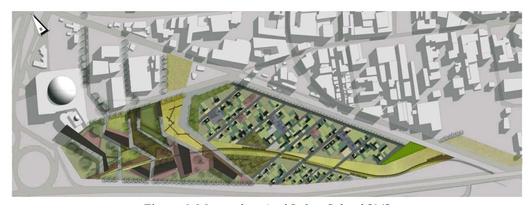
Figure 6. Masterplan, Agri Labor School [14]

The allocation of the market assumes the turnover from the bus station and the Dendropotamos residential area, however it's questionable, in addition far away from residential areas that are northern from the site. Public thematic gardens have an affluent urban character, whether the exposed demand for this kind of use is legitimate. Residents are reusing the containers, according the crisis situation and the target group of move-in people, although it is a doubtful construction for Mediterranean climate. The most significant modification I would suggest is the organization of the residential houses, insomuch the lack of just the "Red" content. Based on the experiences in Budapest, I would organize the new denizens in small common units, about 30 participants each, and would give them a land for cultivation on the pattern of community gardens. The members should have own parcels, but also a common one, further the existence of one central community building - a place for meetings or common meals is essential. Equal principles could be applied by the citizens of the neighbourhood too. Communities of these sizes can arrive at a decision; compose a sustainable unit, enabling the rooting of the inclusion of urban agriculture into the existing social context.