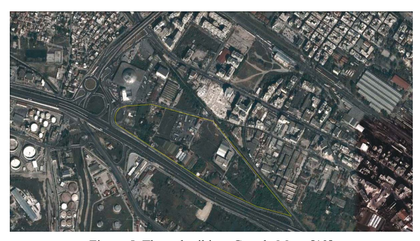
Figure 5. Thessaloniki on Google Maps [13]

Site of the design work is situated in the ecotone of the west wing. The lance-shaped territory presently is a huge fallow field, on the south-west long side, bordered by the main road A/D Path Thessaloniki, the recent tally of the Egnatia. The area is confined with the railway path on the north-east, beyond a socially damaged dwelling district. At the spear-head the speedway and the railway line have an overhead crossing, while at the west end a new dome shaped city bus station (Menemeni) was built in the 2000<sup>th</sup>. South-west to the scene an industrial area, Sindos adjoins. Contingently belonging to the field of the designed activity is the dense residential area Dendropotamos. Urban Agriculture "in the area of "Lachano-Kypoi" had an important history in the nutritional supply of the people of Thessaloniki in former times of extreme sufferings and hardships and it might become a new future in this current moment of crisis."<sup>5</sup> [1]