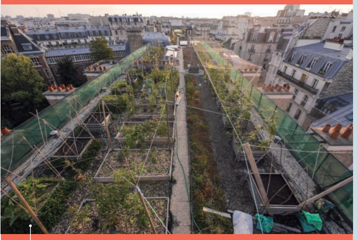
Experimental rooftop kitchen garden at AgroParisTech, rue Claude Bernard, Paris (CIPUrA project)